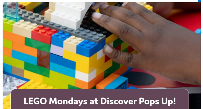
LEGO Mondays at Discover Pops Up!

Calling all fans of lego for Lego Mondays! Or anyone who hasn't tried lego building before but wants to give it a go. Free drop-in sessions at the Discover Pops Up! at Stratford Centre (opposite Costa Coffee) Ages 5-11; time 3.30pm-5pm. Visit website to book a free slot.